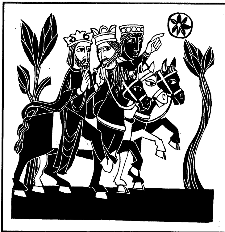
Steve Erspamer, SM. Liturgy Training Publications. Reprinted with permission

SACRAMENT OF BAPTISM - Contact the Parish Offices for baptism dates and to register for preparation sessions.