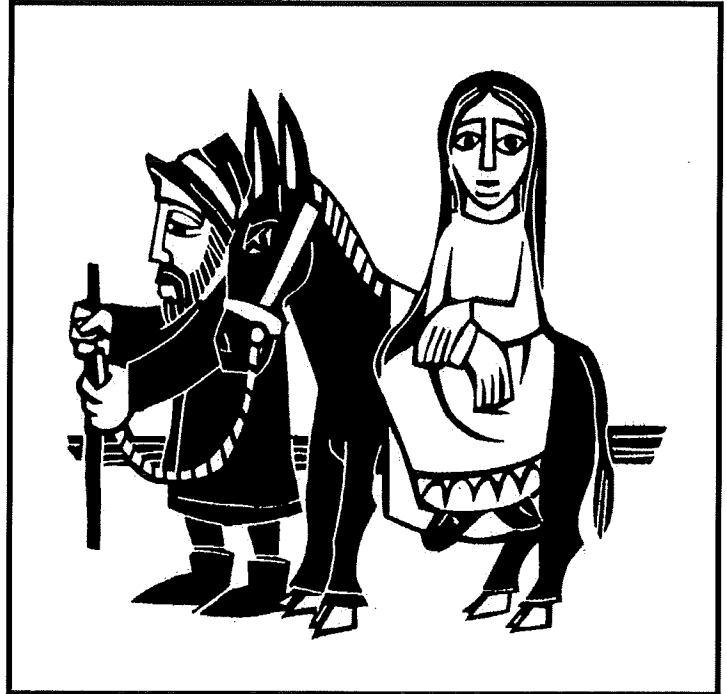
Steve Erspamer, SM. Liturgy Training Publications. Reprinted with permission

SACRAMENT OF BAPTISM - Contact the Parish Offices for baptism dates and to register for preparation sessions.